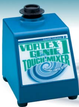
HIGH SPEED MIXER